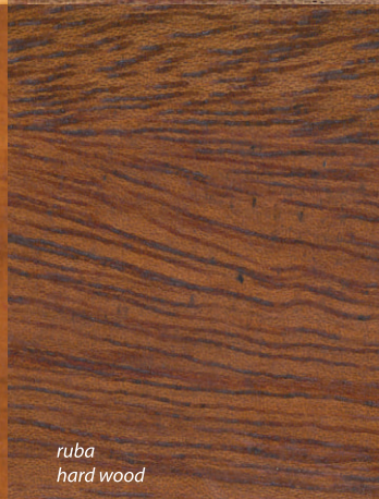
clear hard wood