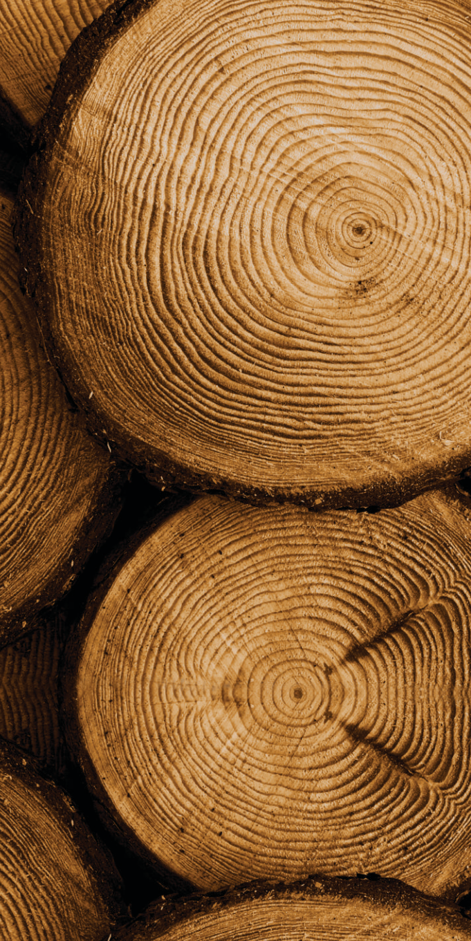
clear soft wood